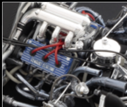
Highly detailed engine