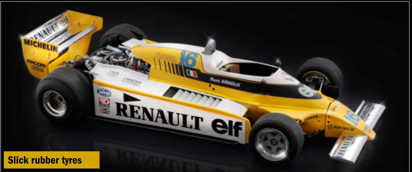
Slick rubber tyres