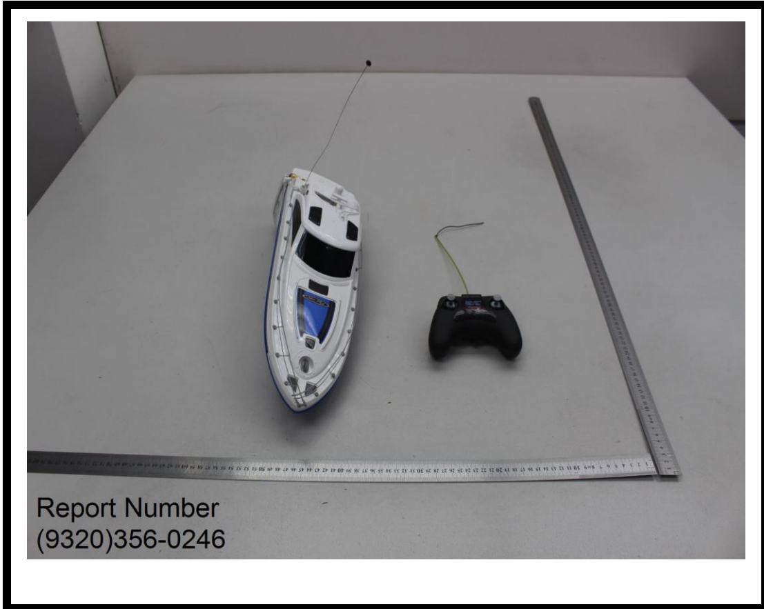
Photo of the Submitted Sample

LAB NO. : (9320)356-0246-B DATE : Dec 31, 2020 PAGE : 3 OF 6