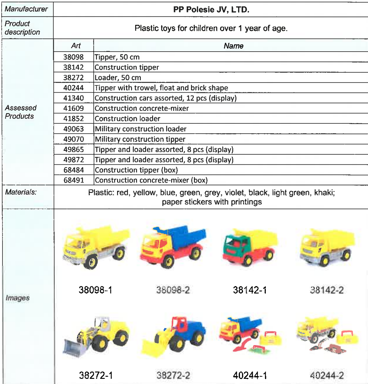
Table 1 – Product specification

The client – PP Polesie JV, LTD., Sovetskaya Str. 141, 225304 Kobrin, Republic of Belarus - has applied for the assessment of conformity of the following toys (hereafter Products) with the requirements of the relevant regulations: